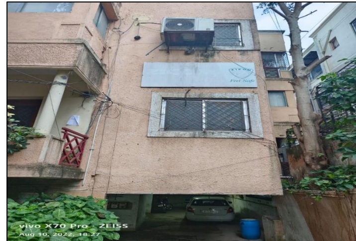
Albert Court, Albert Street, Richmond Town, Bengaluru