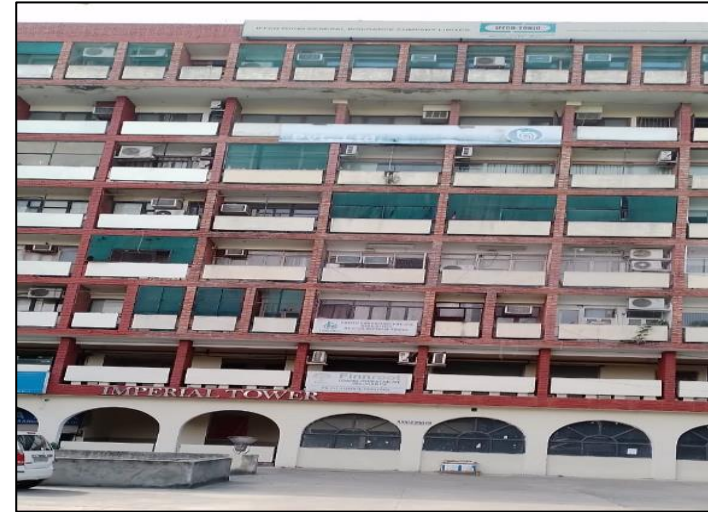
Ansal Imperial Tower, Naraina Vihar, New Delhi