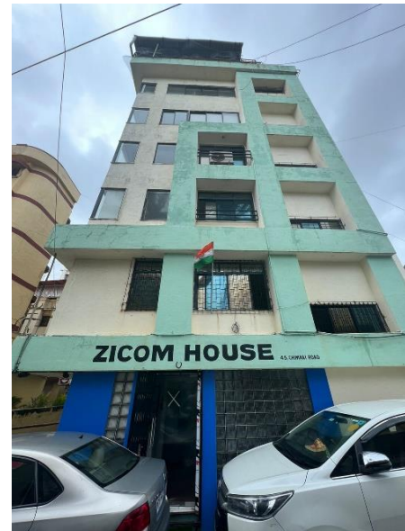
Front elevation of Zicom House, Bandra West, Mumbai