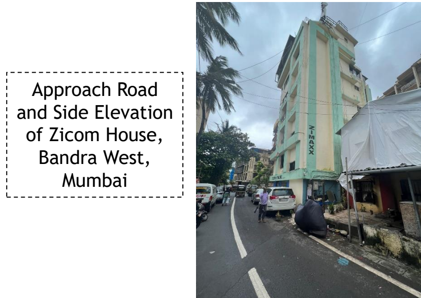
Approach Road and Side Elevation of Zicom House, Bandra West, Mumbai